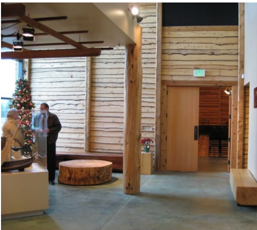
Lobby of longhouse with door open to gathering hall.